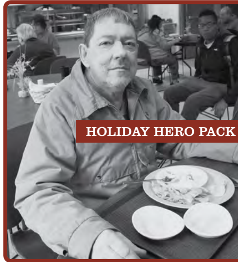
HOLIDAY HERO PACK

Shop our Gift Catalog online at uticamission.org/GiftCatalog . Or simply add your special Christmas gift to the enclosed reply card.